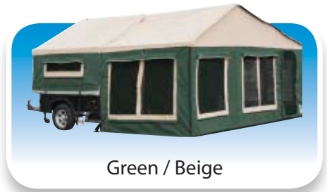
Green / Beige