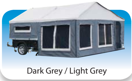
Dark Grey / Light Grey