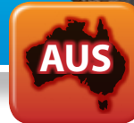
100% Aussie Built