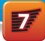
7 Leaf Springs