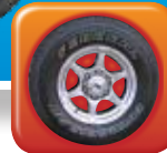
15" Alloy Wheels

(Please note: spare wheel, jerry can and gas bottle are for illustration purposes only)