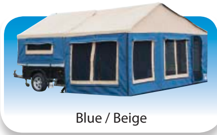
Blue / Beige