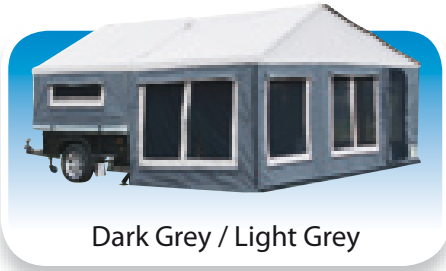
Dark Grey / Light Grey