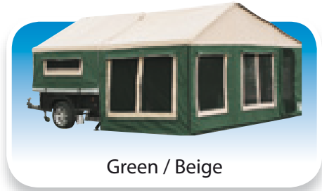
Green / Beige