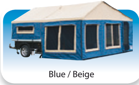
Blue / Beige